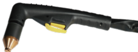
TP 130 MANUAL torch