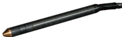
TP 130 CNC torch