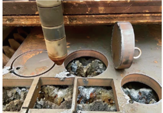
25 mm M.S.