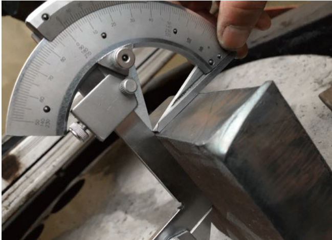
*35mm M.S Air&Air * Taper degree less than 0.2 degree

High performance cutting with high speed, make a smooth surface and remain low rectangularity tolerance on parts.